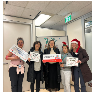
(Left to Right)